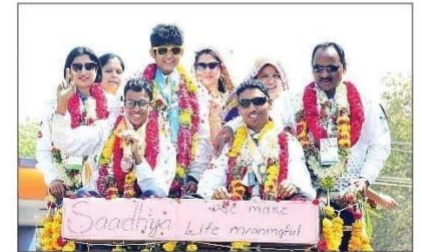
ಆಟುಧಾಖೆಯಲ್ಲಿ ಇತ್ತೀಚೆಗೆ ನಡೆದ ವಿಶ್ವ ವಿಶೇಷಚೇತನರ ಒಲಿಂಪಿಕ್ಸ್ ಕ್ರೀಡಾಕೂಟದಲ್ಲಿ ವಿಕಲಚೇತನರ ಸಾಧ್ಯ ವಸತಿ ಶಾಲೆ ವಿಶೇಷ ಮಕ್ಕಳನ್ನು ಹೊಸಪೇಟೆ ರೈಲ್ವೆ ನಿಲ್ದಾಣದಿಂದ ತೆರೆದ ವಾಹನದಲ್ಲಿ ಮೆರವಣಿಗೆ ಮಾಡಲಾಯಿತು.